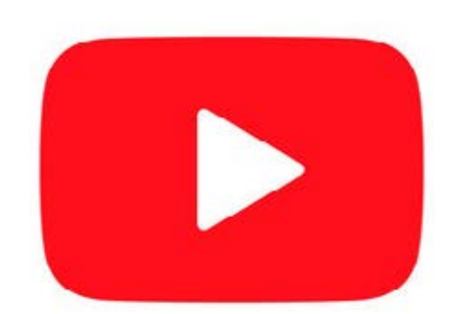
Click to Watch on YouTube