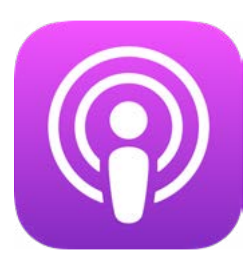
Click to Listen on Apple Podcasts